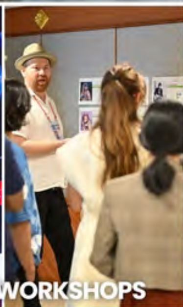
SESSIONS & WORKSHOPS